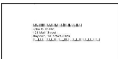
The old Postnet/Planet systems...