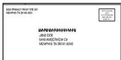
Will be replaced by the more robust 4-State system

communications option. Although the 4-state barcode is currently used in postal services around the world (most notably with Royal Mail in the U.K. and the Australian Post Office), to date it has been used only on a voluntary basis in the U.S. The 4-state