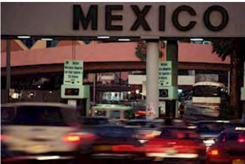
US Border at Tijuana, Mexico

On December 4, 2006, a new law was passed that gives Mexican trucking firms access to roadways throughout the U.S. This provision enables Mexican trucking companies to long haul cargo of Mexican origin to its destination in the U.S. As a result, the DOT is set to start a pilot program this April, which allows 100 Mexican trucking companies to haul cargo to its destination in the U.S. As it currently stands, the process of shipping goods from Mexico into the U.S. consists of three drivers. This has been a very controversial issue for over a