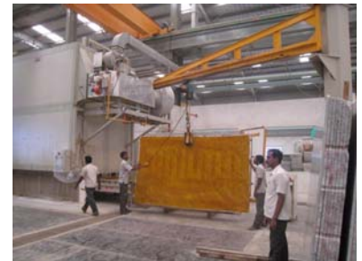
Marble Manufacturing Facility in Chennai, India

SDS's agent in Chennai was seeking to team with SDS in a joint venture that would take advantage of SDS's international transportation expertise.