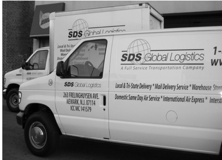
The new look reflects customer demand for increased services, with a global reach