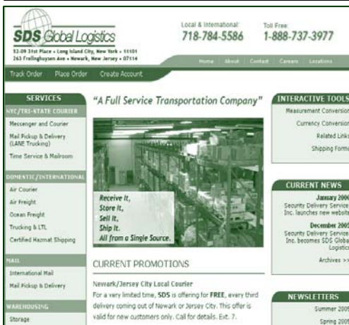
An informative and easy to use home page

and customers will see no change in the day-to-day service as we continue to provide quality, reliable, and client-focused service. What they will see is an increase in the product lines available to them through SDS."